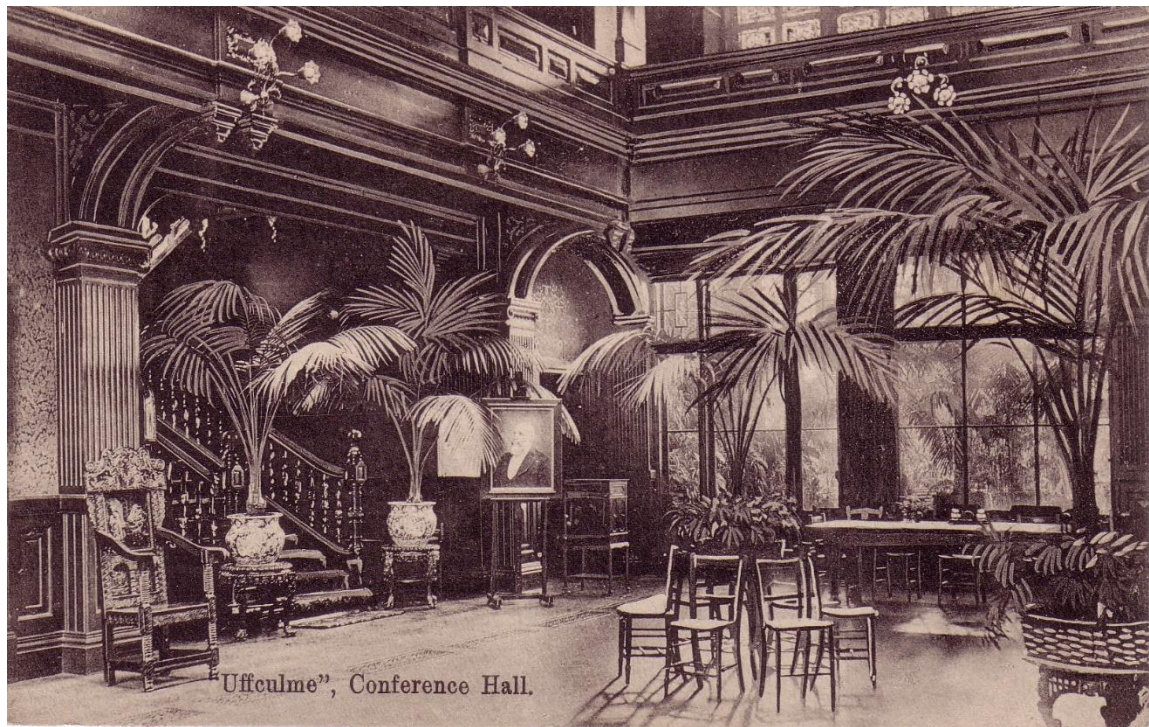
Uffculme", Conference Hall.

and garden and which is made of cast iron with a lead roof. The hall was thought to have been used for entertaining and charity events.